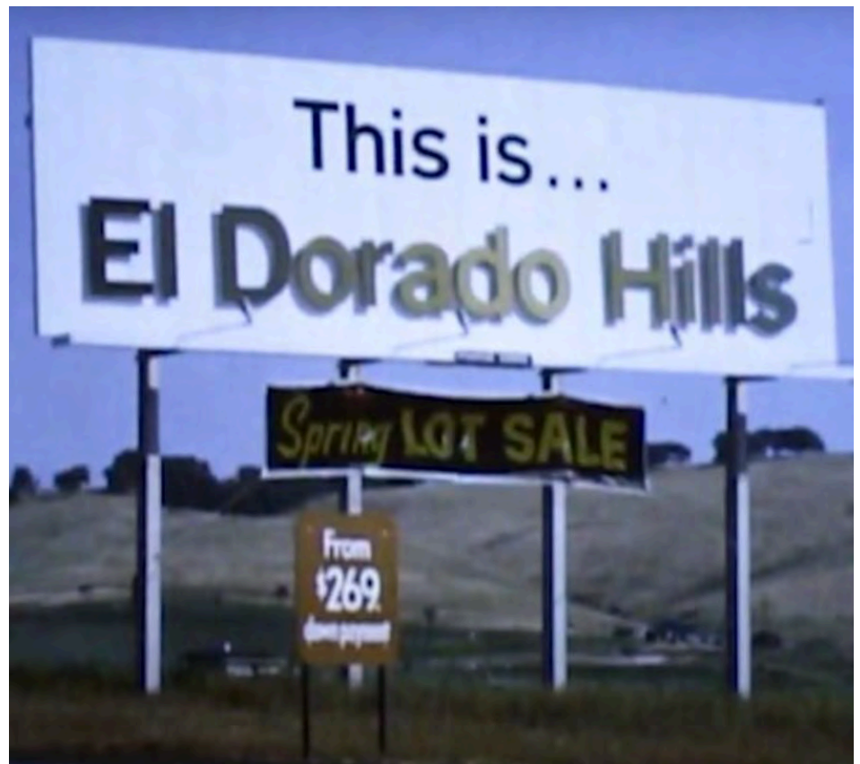
Archived video

To provide a voice for Bass Lake homeowners in dealing with the county and other community agencies. To keep homeowners informed about issues and meetings.