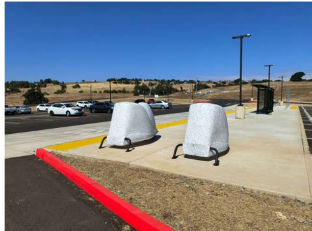
Bass Lake Rd Park & Ride Bike Storage Pods

For more information on the Bass Lake Park-and-Ride Lot or El Dorado Transit services and schedules, visit eldoradotransit.com .