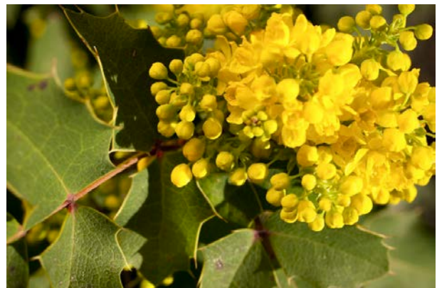
Creeping Mahonia

With a little planning and effort, you can create a thriving and beautiful landscape using native groundcovers here in the Bass Lake area.