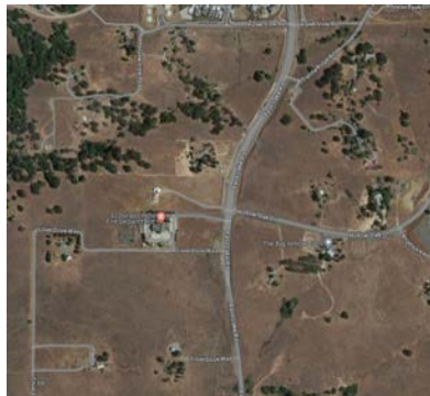
Silver Dove Bike Park Site

For the Bass Lake Community, one of the potential issues to consider will be traffic and circulation impacts - Bass Lake Road at Silver Dove still remains a 2 lane road, very close to the Hollow Oak Dr intersection. While not on the current 20 year County Capital Improvement Program, Bass Lake Road between the Highway 50 interchange and Serrano Parkway is still suggested to become a four lane alignment... someday. The current designs for the Silver Dove Bike Park place it very close to the existing Bass Lake Road alignment, and it could conceivably be impacted by future road expansion. El Dorado Hills Fire Department has also suggested a desire for an improved alignment at the Station 86 Fire Station on Bass Lake Rd at Hollow Oak, as the current conditions have the Station 86