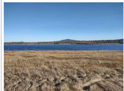
Bass Lake Regional Park

The EDH CSD has conducted significant community outreach and engagement in regards to the Regional Park Development over several years. The Bass Lake Action Committee is looking forward to continued collaboration between residents and the EDH CSD to realize the thoughtful development of the Bass Lake Regional Park, preserving the natural elements of the park site, and providing El Dorado Hills with a park property that will enhance our community, and serve as the centerpiece of our region.