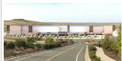
Project Frontier: Setbacks Far Exceed County Requirements