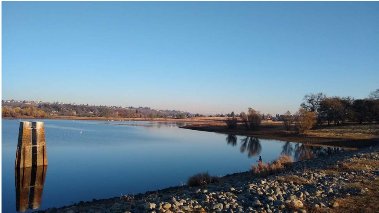
Bass Lake Regional Park development poised to move forward