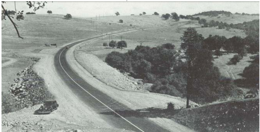
Looking up new Clarksville grade on the realignment of U. S. 50 between Folsom and Placerville

"Looking up the Clarksville grade" I saw this first image in a California Highway's publication from 1940, and knew exactly where it was snapped (Hwy 50 and what's now Silva Valley Parkway in El Dorado Hills)... so I tried to snap a shot from roughly the same spot.