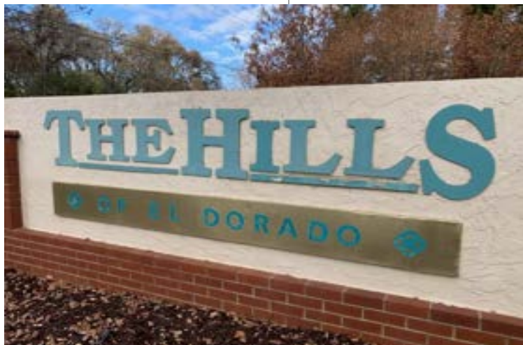
Original Entrance Sign in 2021

Residents have expressed hope that long deferred maintenance will continue, including trimming of oak trees that hang five feet above the sidewalks along Tea Rose Drive, along with landscape freshening, and maintenance of the entrance split rail fence.