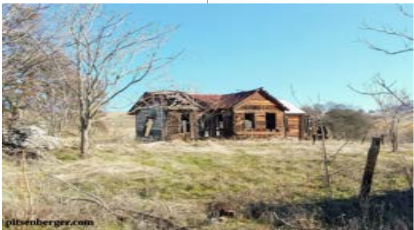
Joerger House - image credit: pitsenberger.com