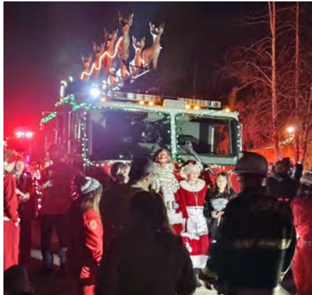
EDH Fire Dept Santa Run, Oak Knoll Park