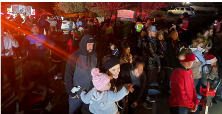
EDH Fire Dept Santa Run, Oak Knoll Park