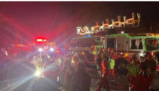
EDH Fire Dept Santa Run, Bridlewood Canyon