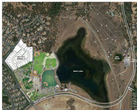
Proposed Bass Lake Regional Park

The El Dorado Hills Community Services District (EDH CSD) continues to move forward with the environmental documents for its proposed 200-plus acre regional park at Bass Lake, with over 700 parking spaces, trails, wildlife/outdoor education, an all abilities playground, and multiple playing fields.