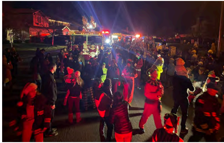
EDH Fire Dept Santa Run, Laurel Oaks Park