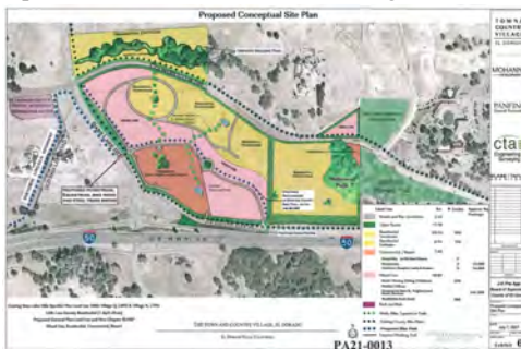
Conceptual Town & Country Village El Dorado

The proposed mixed-use Commercial/Hotel-Hospitality/residential Town & Country Village El Dorado at the southeast corner of Country Club Drive and Bass Lake Road is expected to file a formal project application in 2022. The project seeks to construct a hotel, mixed use, and upwards of 1000 residential dwelling units.