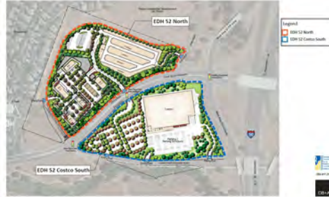
EDH-52 NORTH AND COSTCO SOUTH Proposed Costco/EDH52 Commercial @ Silva Valley Pkwy/US50

Costco is moving forward with their plans for an El Dorado Hills store on the northwest side of the Silva Valley Parkway US50 interchange, alongside the proposed EDH52 commercial center on the northeast side of the Silva Valley Parkway US50 interchange. A partial extension of Country Club Drive on the north sides of these projects may be a result of development.