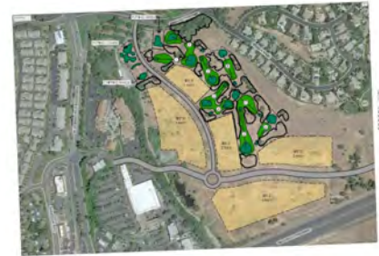
One of 4 conceptual EDH CSD 9-hole Golf Course designs

The EDH CSD also has been considering alternate uses for the old El Dorado Hills Executive Golf Course property, if they were to be able to obtain the property through purchase from Serrano Associates. Several conceptual short golf course designs were recently shared with the public.