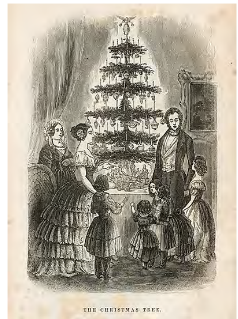
THE CHRISTMAS TREE.

The Sun God Ra in Egypt typically became weaker as it became colder and darker and solstice was seen as a turning point in seasons. Egyptians would decorate their homes with palm leaves and branches, and similarly in ancient Rome a feast called Saturnalia was held during solstice which encouraged people to decorate with evergreens as a celebration of springtime and the bountiful harvest to come. -