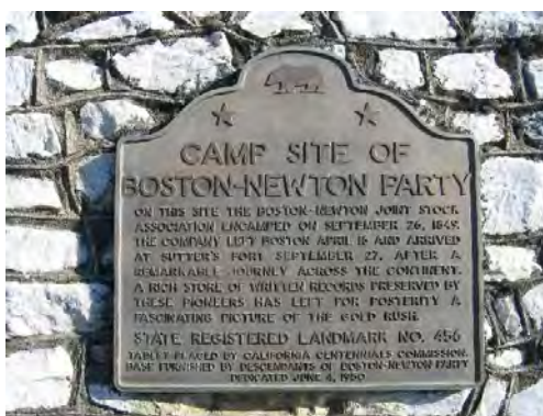
Camp Site of the Boston-Newton Party Historical Marker