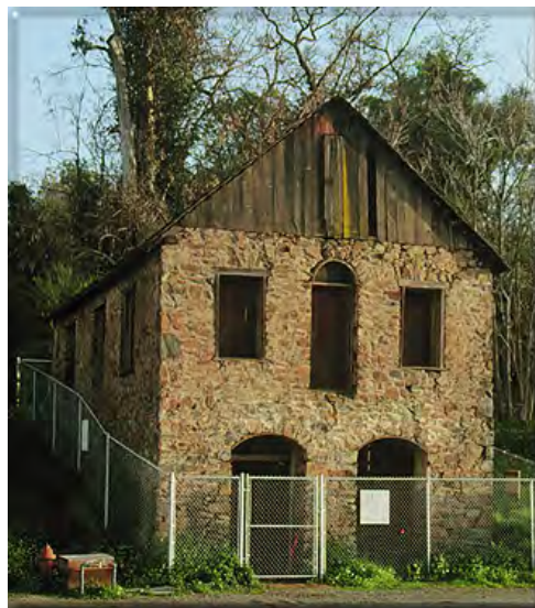
Shingle Springs Wells Fargo Building, Stone House