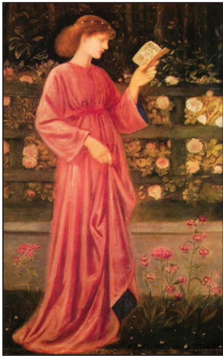
Edward Burne-Jones (1833-1898)

As before, the information will contain current prices and will be based on local, national and international news and industry sources. The first article will appear in the July Bass Lake Bulletin . ~