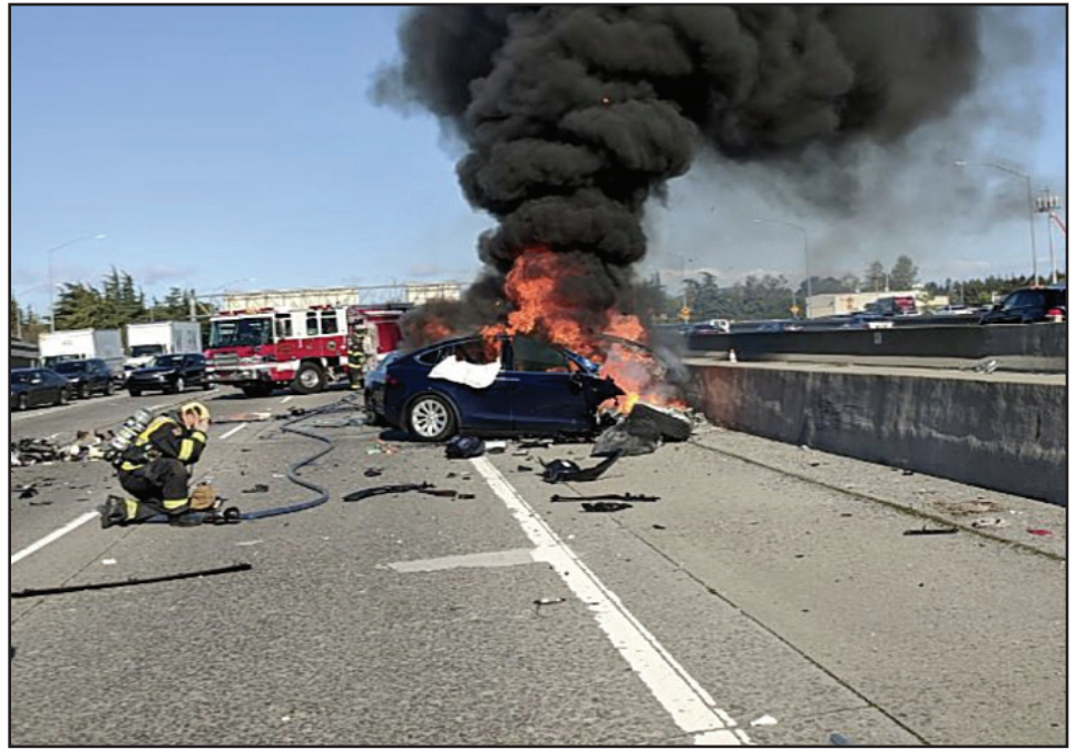
Tesla which recently crashed in Mountain View, California