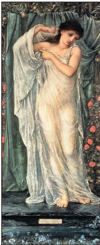
Summer - Bourne-Jones