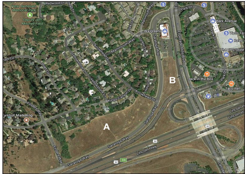
Map showing the locations of the proposed surgery center (A) and the new Shops at El Dorado Hills (B)

The court’s decision invalidating Measure E’s unconstitutional amendments will restore underlying General Plan policies from voter-approved Measure Y requiring new development to pay Traffic Impact (continued on page 2)