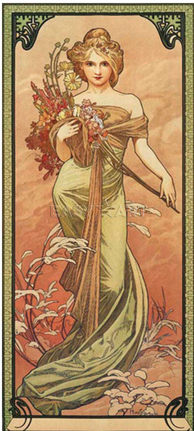
Alphonse Mucha (1860 - 1939)