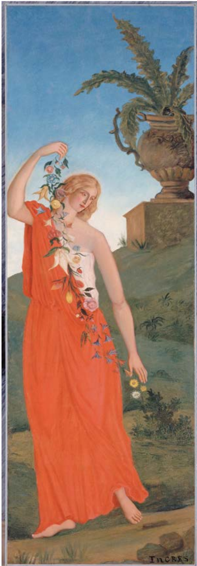
THE FOUR SEASONS, SPRING, by Paul Cezanne, (1839–1906)