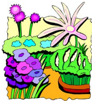
Plant a Garden

The portion of Silva Valley Road that goes under Highway 50 is getting a new name — Clarksville Crossing.