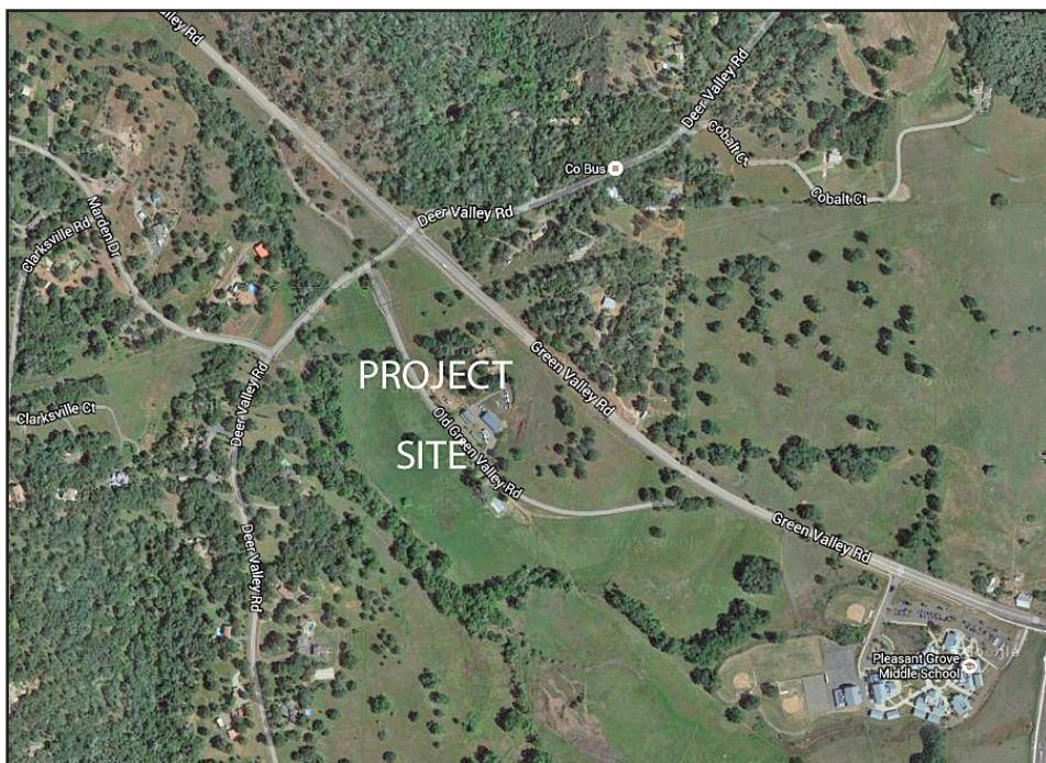
Map showing the location of the proposed equestrian center on Green Valley Road

office/conference rooms will consist of approximately 4,000 square feet on the second or upper floor.