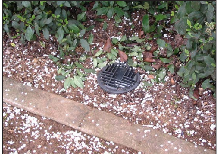
One of the new LED light fixtures on Madera Way entry