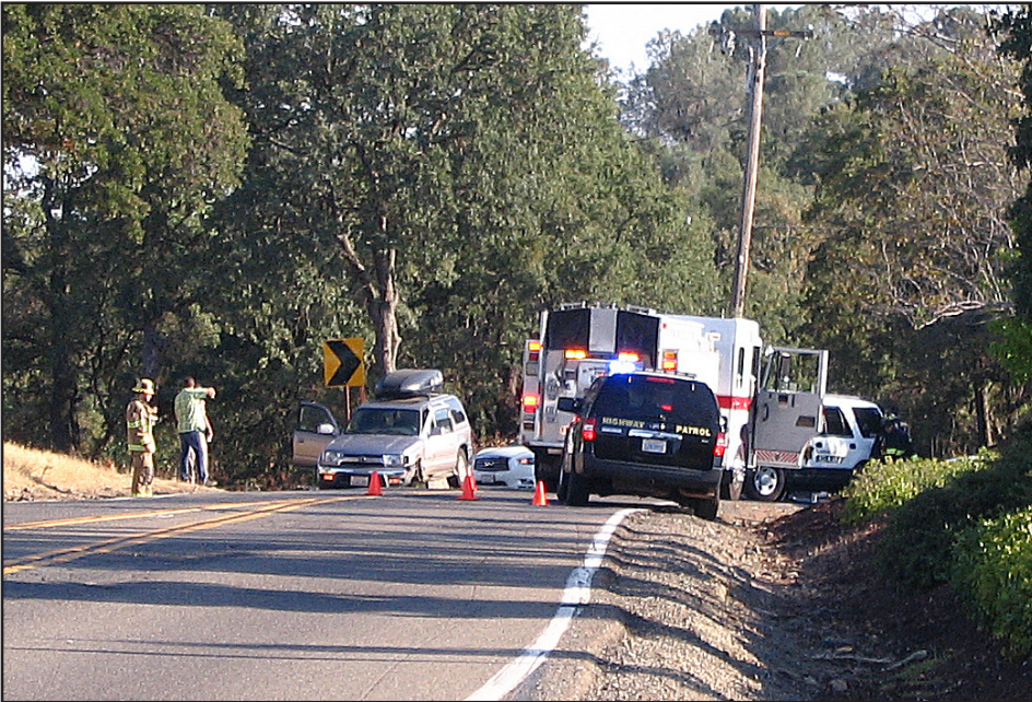
Aftermath of a collision on the sharp curve of Bass Lake Road.