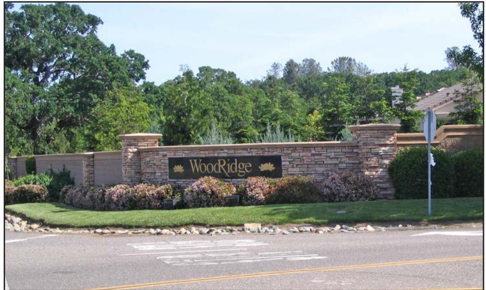
Woodridge entry at Bass Lake Road and Madera Way