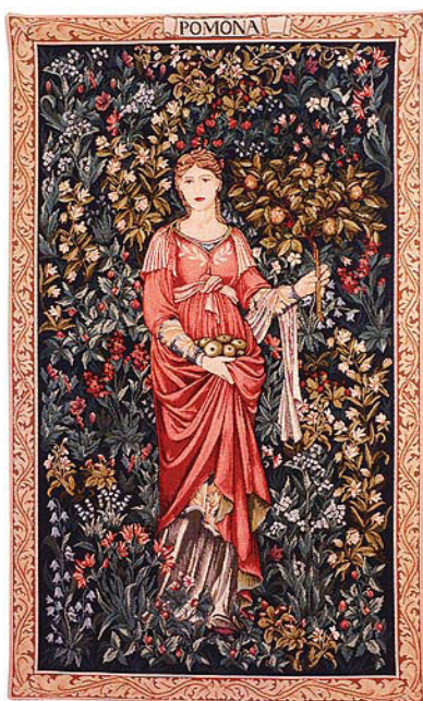
Pomona's Tapestry — Edward Burne-Jones

Construction on the new facility began in March of 2014 and was completed ahead of schedule. Funding for the $5.7 million shelter project came from the County's General Fund and Tobacco Settlement dollars. Local animal welfare groups and citizens also helped raise funds to purchase some needed equipment and other enhancements for the project.