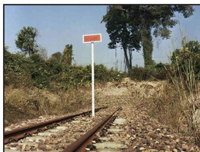
The end of the tracks

So if the supervisors increase Latrobe FPD's tax allocation, they must also decrease the size of the county general fund's tax allocation. ~