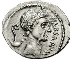
Old Roman coin depicting Julius Caesar

The March 7 price for Bass Lake homeowners who contract with JS West Propane was $2.21 per gallon, based on a fifty-cent markup over the wholesale price plus up to ten cents per gallon transportation charge. Last month at the same time the JS West contract price was $2.50 per gallon. ~