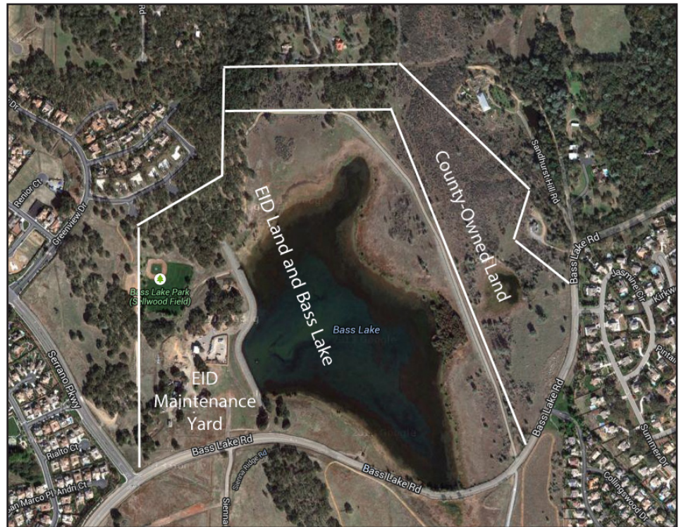
Map showing the roughly 150 acre Bass Lake property on the left and the 41 acre parcel already owned by the county on the right.