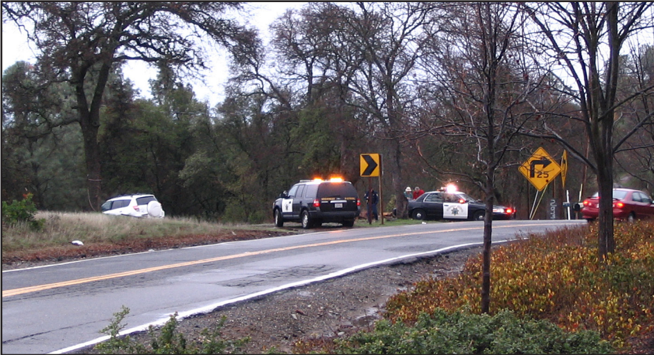
California Highway Patrol cars respond to the latest wreck on Bass Lake Road. The white car off to the left was involved in the collision.