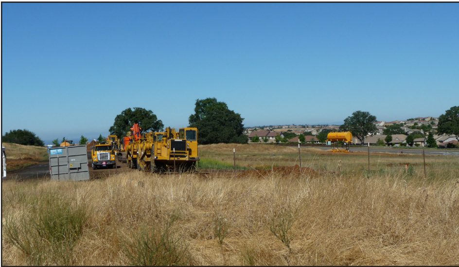
Construction equipment beginning work on the Sienna Ridge Road realignment, with the intersection of Bass Lake Road and Seranno Parkway visible in the right background.

Construction has begun on the realignment of Sienna Ridge Road (formerly old Bass Lake Road). The realignment will complete the intersection at Bass Lake Road and Seranno Parkway, with Sienna Ridge being the new south-bound street. Excavation of the new roadbed will furnish fill for rough grading the corner lots on each side of the new roadway.