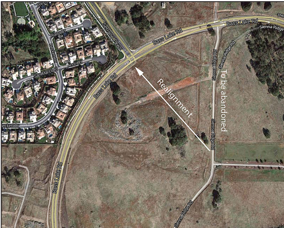
Map showing the realigned route of Sienna Ridge Road and the old roadway to be abandoned.