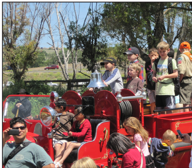
The Rescue Antique fire engine was a big attraction, especially for children, at Clarksville Day