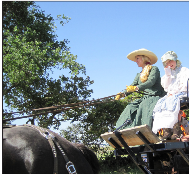
Members of Boy Scout Troop 465 enjoy a wagon ride before taking up their duties as volunteers at Clarksville Day.

See more about the Clarksville Region Historical Society by visiting their website at edhhistory.org . ~