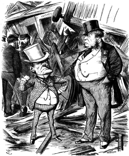
I told you that bullet train was trouble!