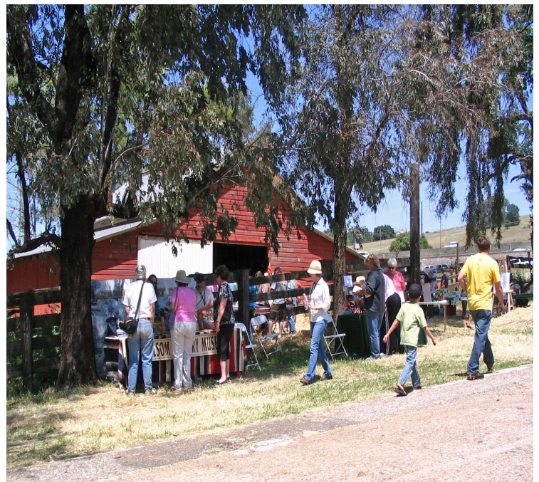
Scenes from Clarksville Day 2010: Upper left, one of the free wagon rides; above, historical exhibits in front of the Old Clarksville Schoolhouse, now converted into a horse barn, along the Lincoln Highway.