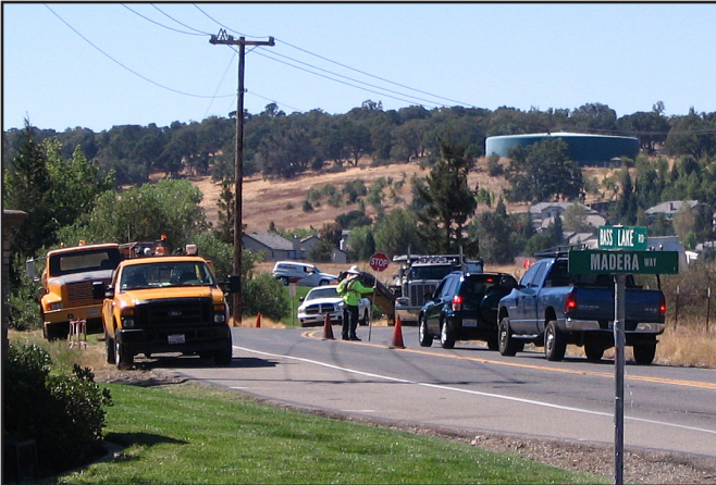
Road crew paving Bass Lake Road near Madera Way