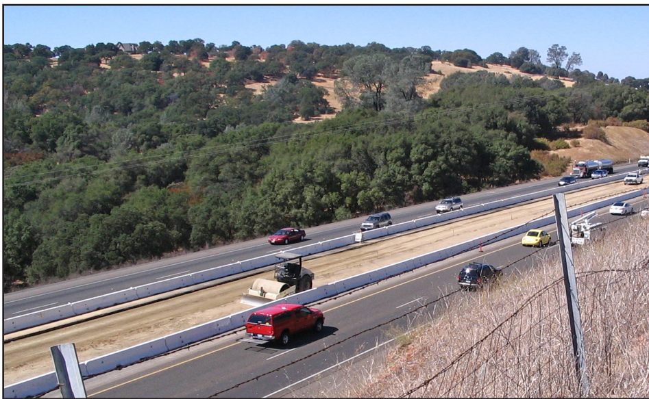
Work proceeds on the new HOV lanes east of Bass Lake Road

The main weather story of last winter was the record-breaking snow in the mid-Atlantic, and while the amount of snow is not expected to be epic, this region is forecast to be in the battleground of winter weather. ~