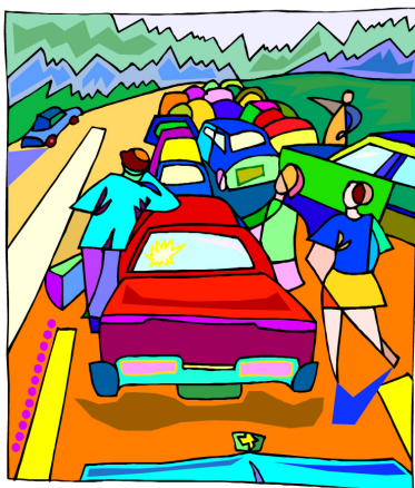
The future White Rock Road?

The thoroughfare portion of the Connector is described as similar to an urban arterial, with four to six traffic lanes. The left turns are limited to at-grade signalized intersection. These intersections are to be spaced a minimum of one half mile apart, with one mile spacing preferred and quarter-mile spacing allowed only in locations where consolidation of existing and approved intersections is not feasible. Direct access will also be minimized, with any driveways to be consolidated or eliminated where feasible.