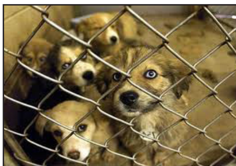
We're looking for a home!