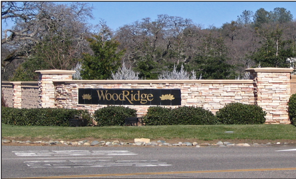
One of the Woodridge entry signs on their LLAD