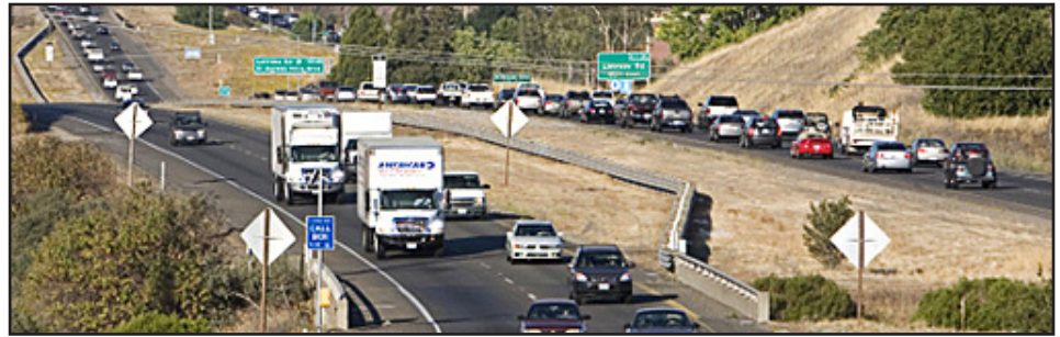
Looking along Highway 50 toward El Dorado Hills Boulevard, where the present HOV lane ends

Higher mortgage rates have decimated real estate demand, resulting in an oversupply of homes as people put off purchases. Analysts say that Toll's wealthy buyers are waiting to see what effect the housing fall-off will have on the economy. ~