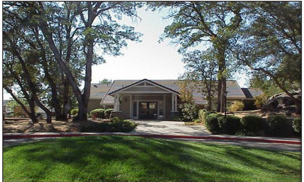
The clubhouse at Oak Knoll Park in the Hills of El Dorado