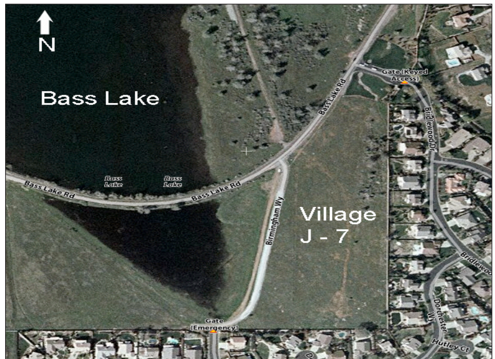
Map showing location of Serrano Village J-7 adjacent to Bridlewood Canyon