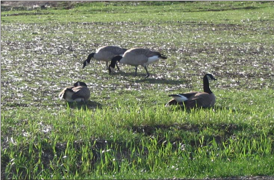
Some of our own Canadian Geese across Bass Lake Road from the lake