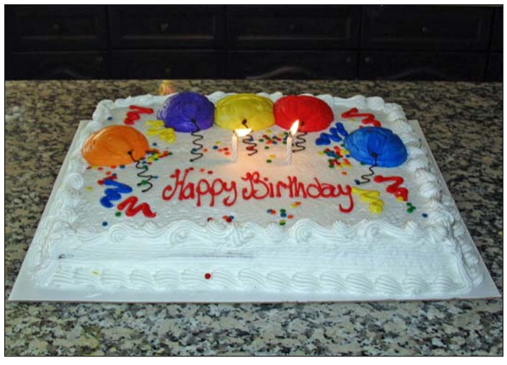
The lovely and very delicious cake