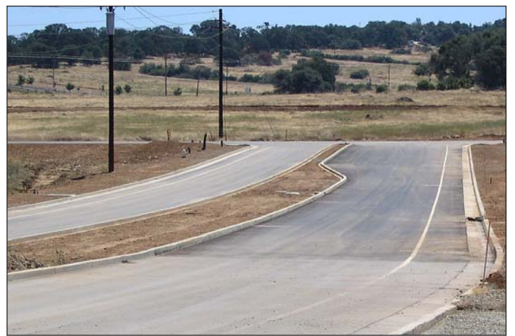
Looking eastward on the Serrano Parway extension towards the new intersection with the realigned Bass Lake Road. Old Bass Lake Road is in the distance.

The long awaited linkup between Bass Lake Road and Serrano Parkway is finally becoming a reality, and is scheduled to open to traffic the first week in August. Completion of this connector means the savings of countless hours of driving for residents of the Bass Lake area who wish to frequent the shopping areas of Town Center, the Raley's shopping center, and other amenities such as the El Dorado Hills Post Office.