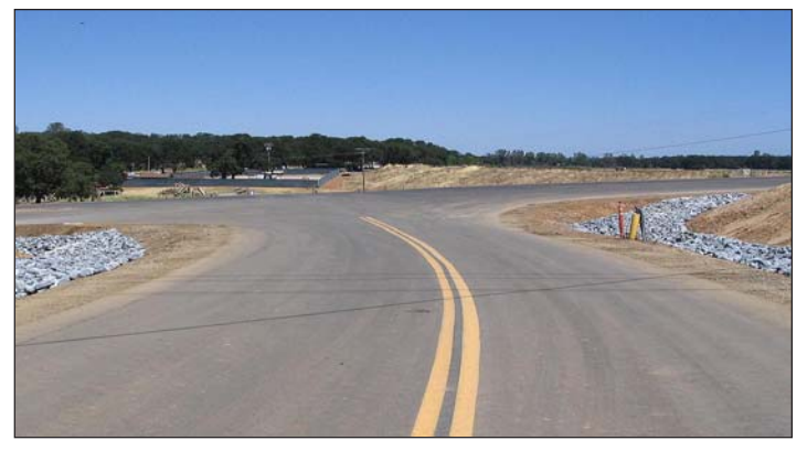
Looking northward to where the existing BassLake Road intersects with the realigned Bass Lake Road. Note the entrane to the Bass Lake EID facility accross the way.