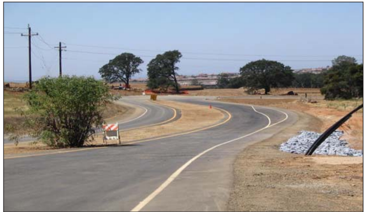
Looking westward to where the realigned Bass Lake Road connects to the new intersection with Serrano Parkway