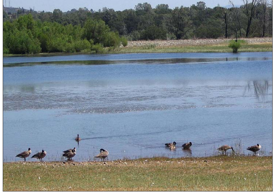
Canadian Geese seen feeding at Bass Lake on a recent day